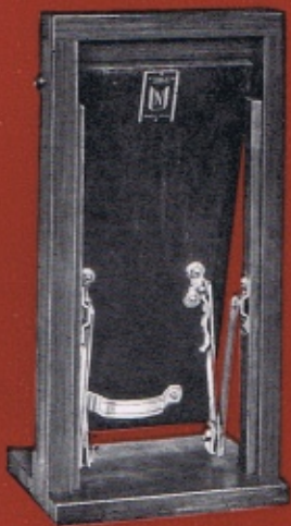
EVERYTHING YOU WANT IN SASH HARDWARE