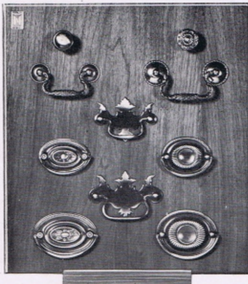
FREE COUNTER DISPLAY BOARD COLOR ILLUSTRATION ON OPPOSITE PAGE

It's BRAND NEW and PACKED with PROFIT. Nothing else like it. An assortment consisting of our finest, most popular furniture trim items. These skillfully created, authentic reproductions have about them a delightful charm that will express itself in PROFITABLE SALES for YOU. ● Packaged in envelopes and contained in cartons to make identification and handling more convenient. Provided with beautiful walnut counter display board that suggests actual application. ● Place your order right now for profit-making National Lock Period Furniture Trim .