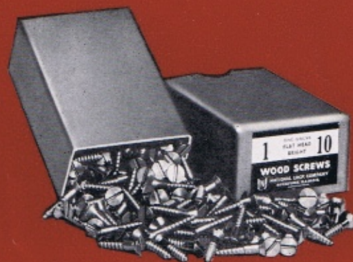
SCREWS AND BOLTS TO MEET EVERY REQUIREMENT