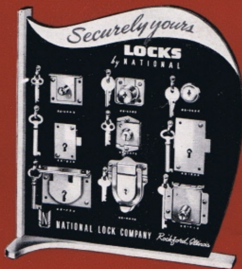
A WIDE RANGE OF LOCKS FOR HOME AND SHOP